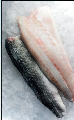
BRONZINO FILLET $10.00/LB