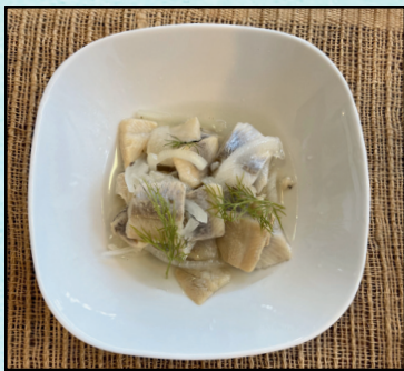
HERRING IN WINE $5.00/QT