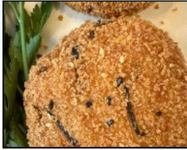
SPICY ASIAN TUNA CAKES $2.50/EA