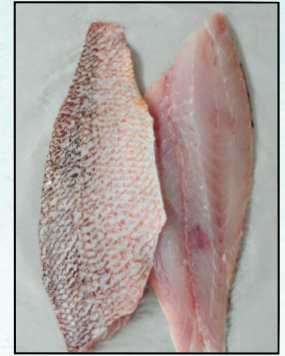
RED SNAPPER FILLET $20.00/LB