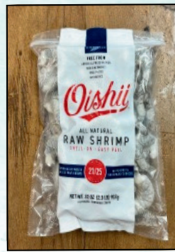
21/25 OISHII SHRIMP 2LB BAG $20.00/BAG