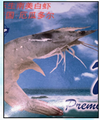
FROZEN WHITE SHRIMP $10.00/4 LB BOX