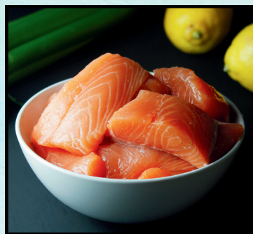
SALMON BUFFET CUT $5.00/QT