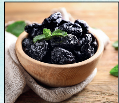
SUGAR PLUMS FROM SPAIN $5.00/QT