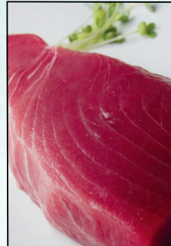
FRESH TUNA LOIN $20.00/LB