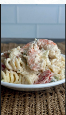
SHRIMP & PASTA $10.00/QT