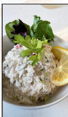
CRAB SALAD $10.00/QT