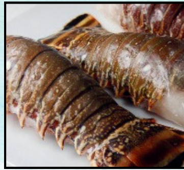
3 OZ TROPICAL LOBSTER TAILS $5.00/EA