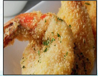
FRESH FRIED JUMBO SHRIMP $2.50/EA