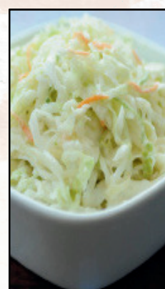
COLE SLAW $10.00/QT