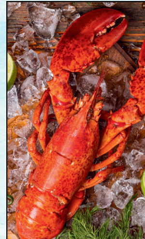
WHOLE STEAMED LOBSTER $10.00/EA