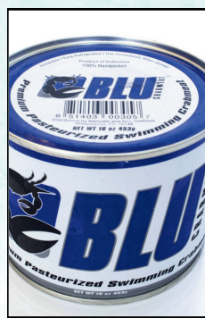
PASTEURIZED LUMP CRABMEAT $20.00/LB