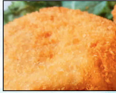
AUNT CONNIE'S HOMEMADE FISH CAKES $2.50/EA