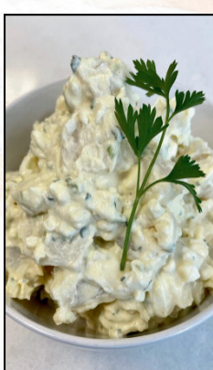
POTATO SALAD $10.00/QT