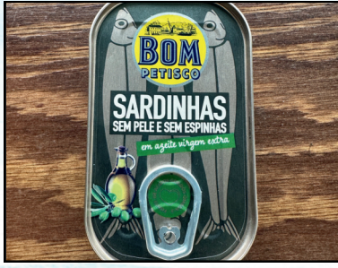
SARDINES FROM PORTUGAL $2.50/TIN