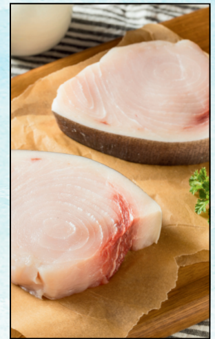
SWORDFISH STEAK $10.00/LB