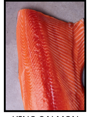
KING SALMON FILLET $20.00/LB