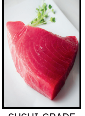
SUSHI-GRADE TUNA $20.00/LB