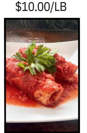
SWORDFISH BRACIOLE 2/$10.00