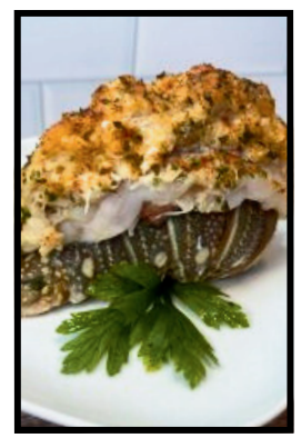
CRAB STUFFED LOBSTER TAIL $10.00/EA