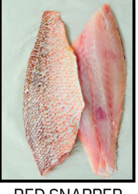
RED SNAPPER FILLET $20.00/LB