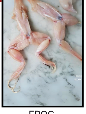
FROG LEGS $10.00/LB