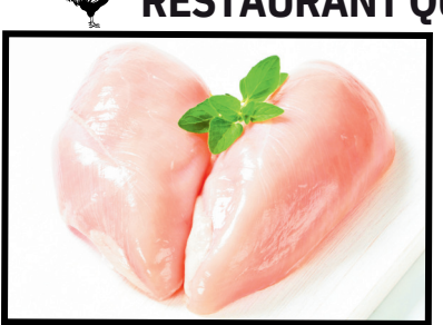
FRESH CHICKEN BREAST $5.00/LB