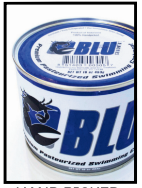
HAND PICKED CLAW CRABMEAT