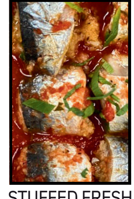
STUFFED FRESH SARDINES $10.00/EA