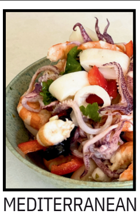
SEAFOOD SALAD 2 LB FOR $10.00