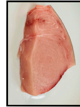
SWORDFISH LOINS $20.00/LB