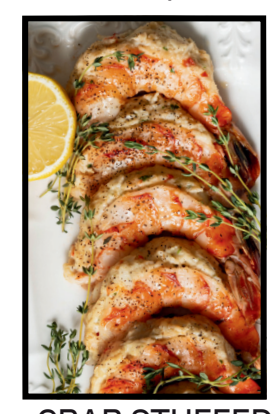
CRAB STUFFED SHRIMP 2/$10.00