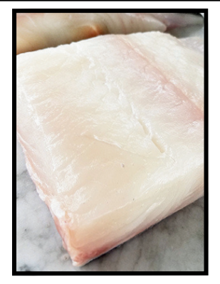
WILD CAUGHT HALIBUT $20.00/LB