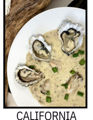
CALIFORNIA OYSTER CHOWDER 2 LB FOR $10.00