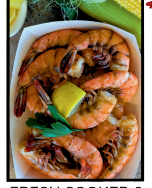
FRESH COOKED & SEASONED SHRIMP