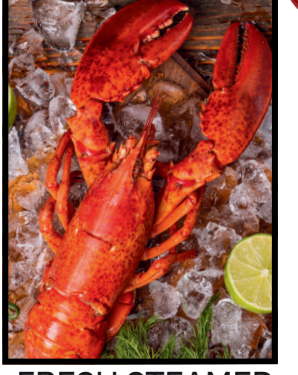
FRESH STEAMED LOBSTERS $10.00/EA