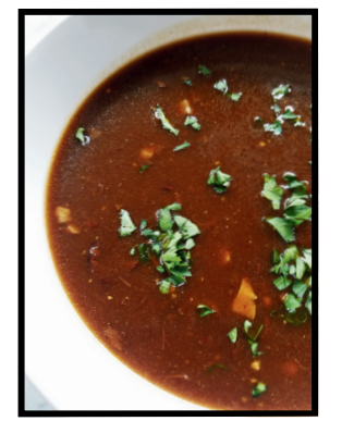
SNAPPER SOUP 2 LB FOR $10.00