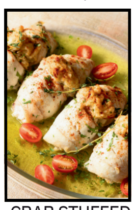
CRAB STUFFED FLOUNDER 2/$10.00