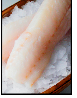
WILD CAUGHT COD LOINS $20.00/LB