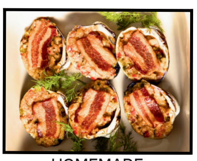
HOMEMADE CLAMS CASINO $10.00/EA