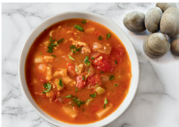
MANHATTAN CLAM CHOWDER