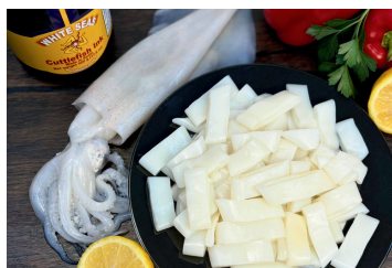
FRESH CLEANED & UNCLEANED SQUID