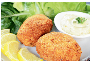
UNCLE TONY'S CLAW CRAB CAKES