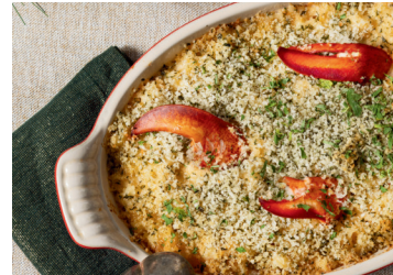
LOBSTER MAC & CHEESE