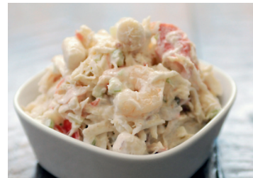
SEAFOOD AMÉRICAIN SALAD