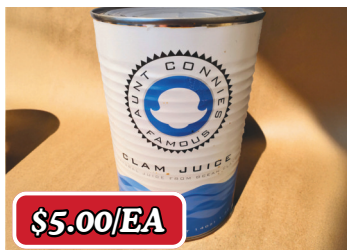
$5.00/EA AUNT CONNIE'S CLAM JUICE