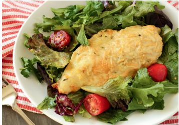
STUFFED CHICKEN BREAST