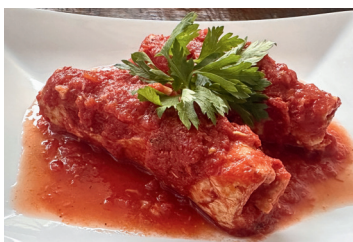
HOMEMADE SWORDFISH BRACIOLE