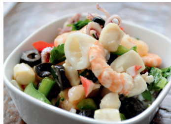
MEDITERRANEAN SEAFOOD SALAD