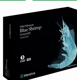
WILD-CAUGHT JUMBO MEXICAN BLUE SHRIMP