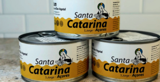
SANTA CATARINA TUNA

The Best From Portugal, Better Than All Others!