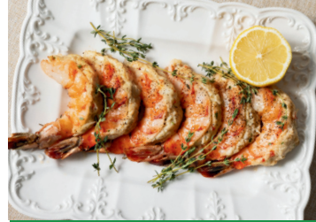
STUFFED SHRIMP WITH CRABMEAT