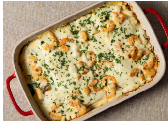
RED OR WHITE SEAFOOD LASAGNA