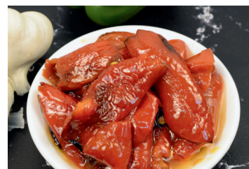
CASALINGA HOUSE-ROASTED ITALIAN-STYLE PEPPERS