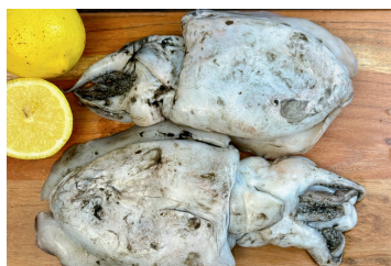
SEPIA FRESH CUTTLEFISH