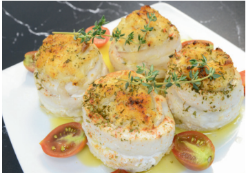
FLOUNDER ROLLATINI STUFFED WITH CRABMEAT