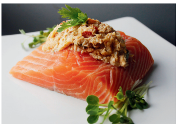
READY-TO-BAKE! CRAB-STUFFED SALMON