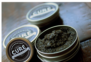
CANTERBURY CURE PREMIUM CAVIAR