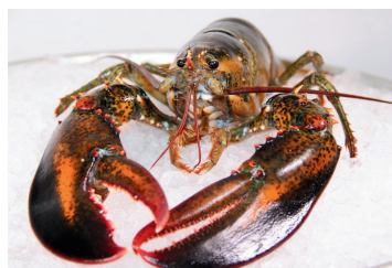
LIVE LOBSTERS ALL SIZES