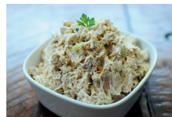
HOMEMADE TUNA SALAD