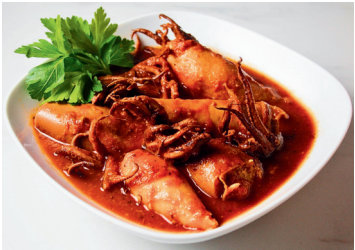
AUNT CONNIE'S STUFFED SQUID