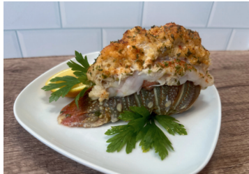
LOBSTER TAIL STUFFED WITH CRABMEAT