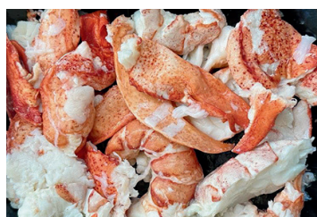
LOBSTER MEAT 2 LB BAGS