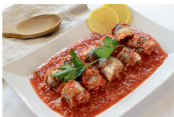
HOMEMADE STUFFED SARDINES