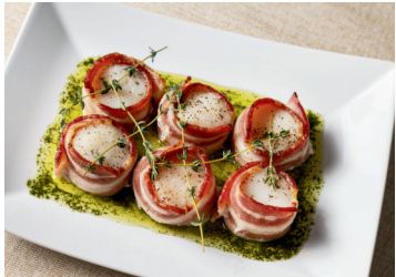
READY-TO-BAKE! BACON-WRAPPED SCALLOPS