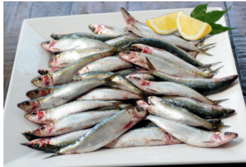
FRESH MEDITERRANEAN SARDINES