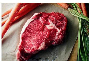
GRASS-FED BEEF RIBEYE STEAKS