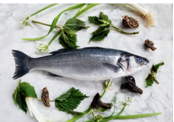
FRESH IMPORTED WHOLE BRONZINO