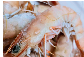
WILD AUSTRALIAN HEAD-ON PRAWNS