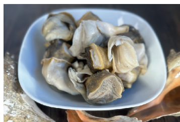
FRESH STEAMED SCUNGILLI