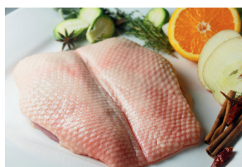
FRESH DUCK BREAST