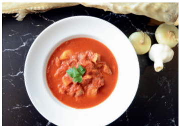
SICILIAN FISHERMAN'S STOCKFISH 'STOCCO' STEW