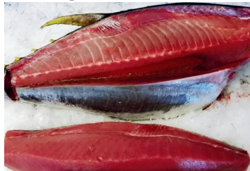
HOUSE-CUT YELLOWFIN TUNA