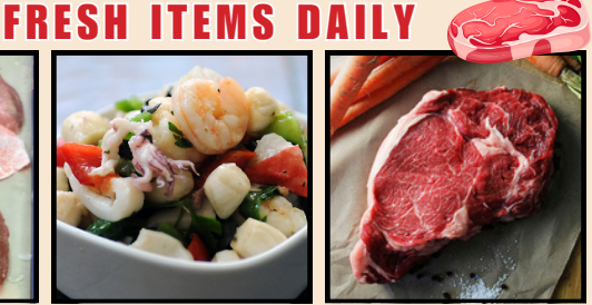
MEDITERRANEAN GRASS-FED BEEF SEAFOOD SALAD RIBEYE (1LB AVG) $15.00/EA